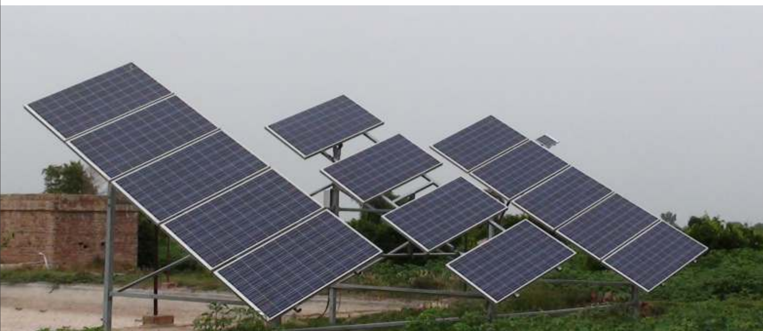
Solar water pumping set at Bassi, Jaipur