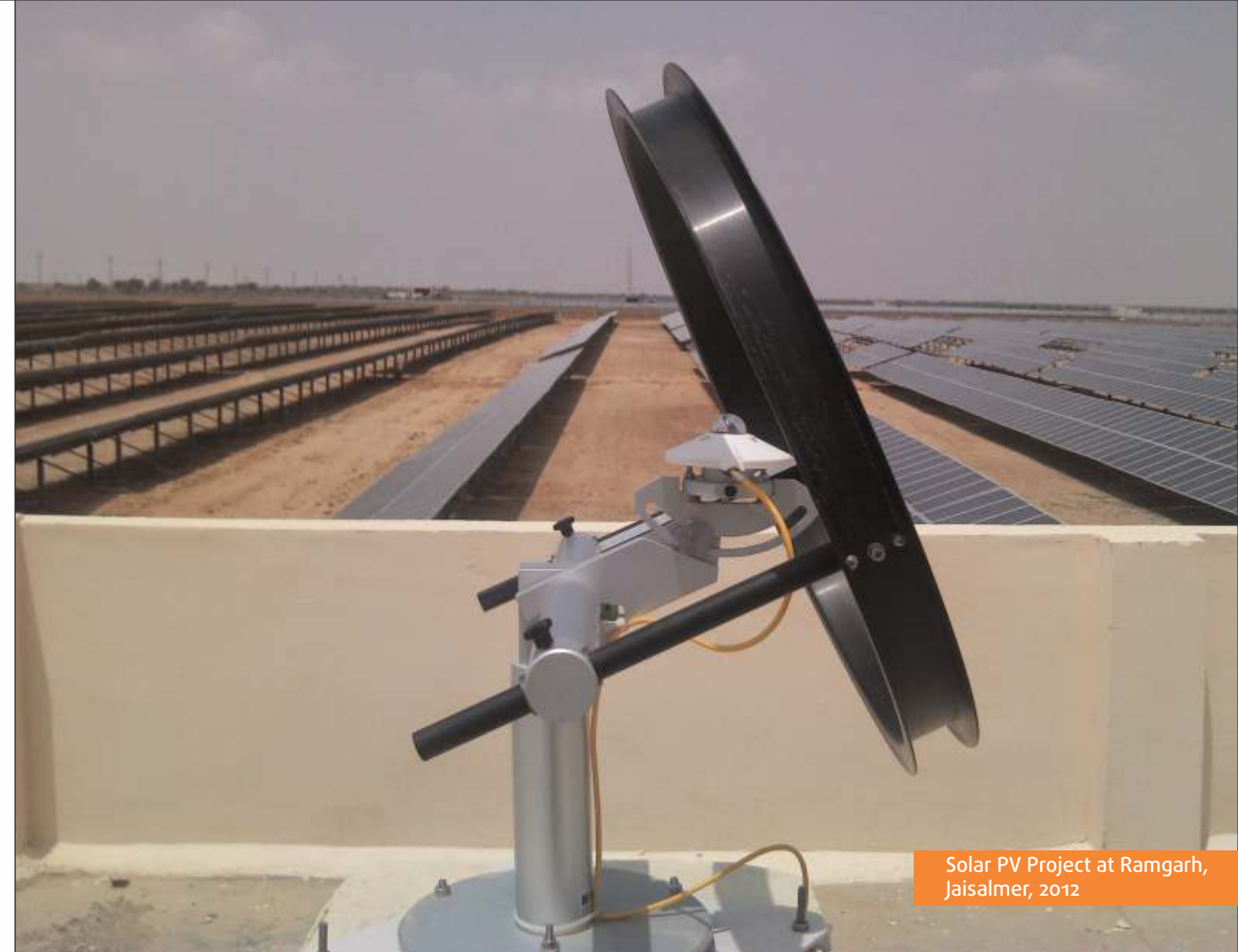
Solar PV Project at Ramgarh, Jaisalmer, 2012