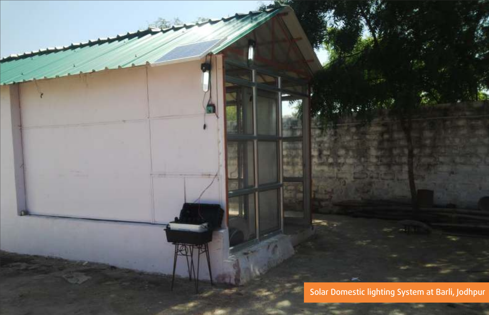
Solar Domestic lighting System at Barli, Jodhpur

schedule for sale of power to licensee / third party or for giving set-off against the consumption of recipient unit in case of captive use as per the relevant regulations of RERC. However, total available Solar Power Plant generating capacity shall be intimated to RVPN / Discoms of Rajasthan for next day.