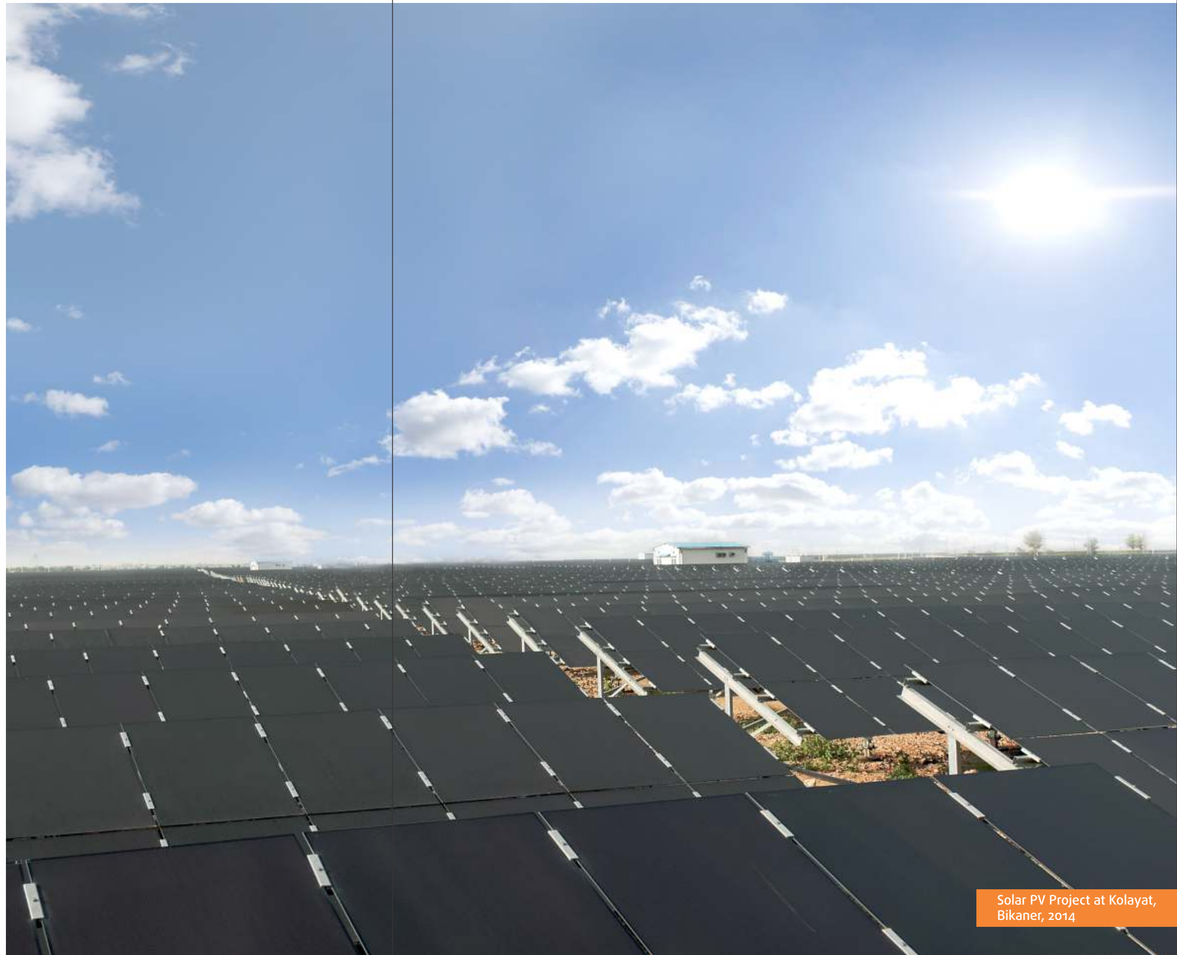
Solar PV Project at Kolayat, Bikaner, 2014

Rajasthan State Pollution Control Board with a view to encourage Solar Power plant in the state has notified solar power plant of all capacities under Green Category. The State Board will issue comprehensive consent to establish and consent to operate for one project. The State