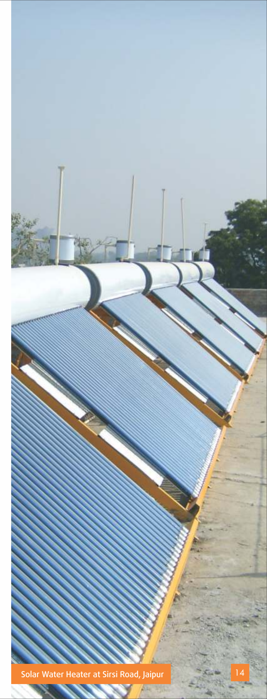
Solar Water Heater at Sirsi Road, Jaipur

17.3 Solar Power Producer to whom Government land is allotted will have to apply for final approval of the project within three months from the date of in-principle clearance by SLSC. If Solar Power Producer fails to apply for final approval of the project within the time prescribed, RREC will recommend for the cancellation of allotment of Government land with the approval of SLEC