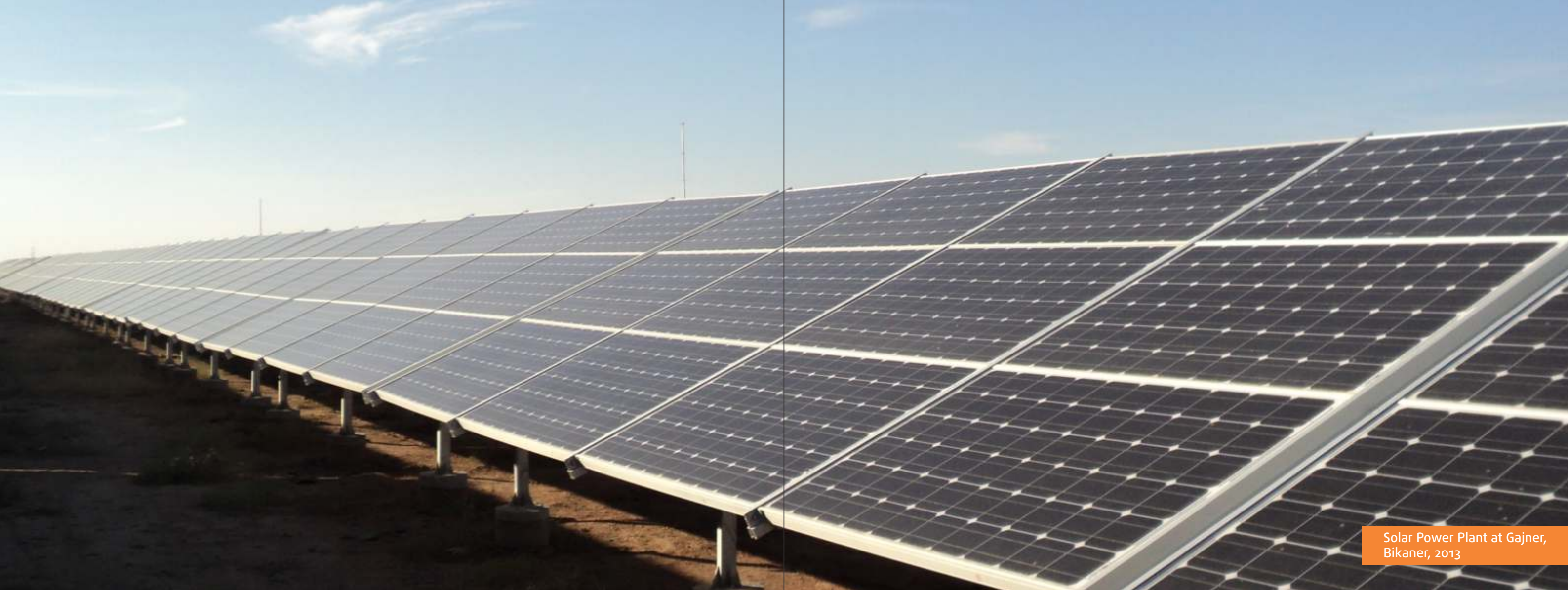
Solar Power Plant at Gajner, Bikaner, 2013