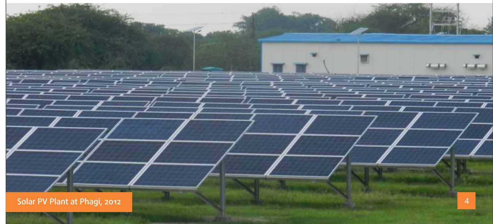
Solar PV Plant at Phagi, 2012